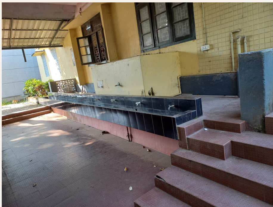
Campus Hand Washing Area