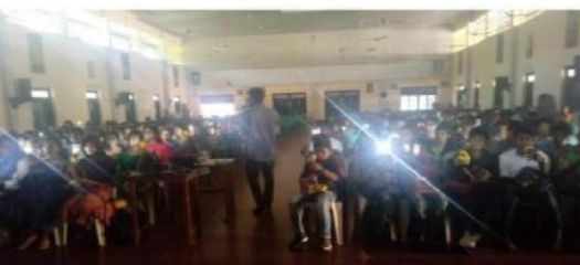
Sensitisation of Future Prospects of Solar energy

In the wake of energy sustainability and mitigating climate change, the idea of “Energy Swaraj” or localized energy self-sufficiency has been conceptualized as a global movement. Gandhi Global Solar Yatra was planned by IIT Bombay not only in India but across the globe to sensitize the